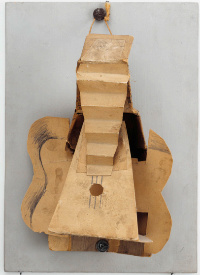
FIG. 1 PABLO PICASSO