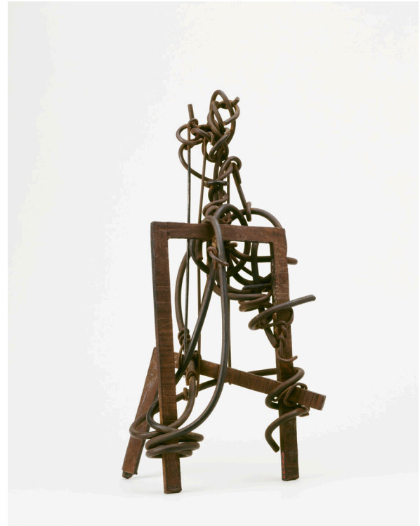
FIG. 3 PABLO PICASSO