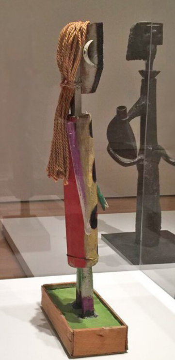
FIG. 4 Side view of Pablo Picasso, Figure, spring 1938