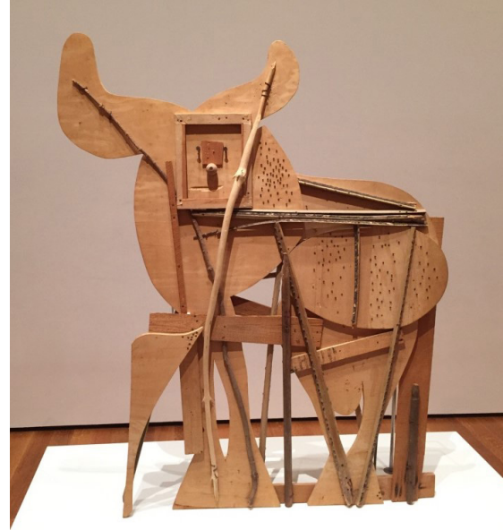
FIG. 5 PABLO PICASSO Bull, April 1958 Blockboard (wood base panel), palm frond and various other tree branches, eyebolt, nails, and screws, with drips of alkyd and pencil markings, 144.1 x 117.2 x 10.5 cm The Museum of Modern Art, New York. Gift of Jacqueline Picasso in honor of the Museum's continuous commitment to Pablo Picasso's art. 649.1983 © Succession Picasso, 2016