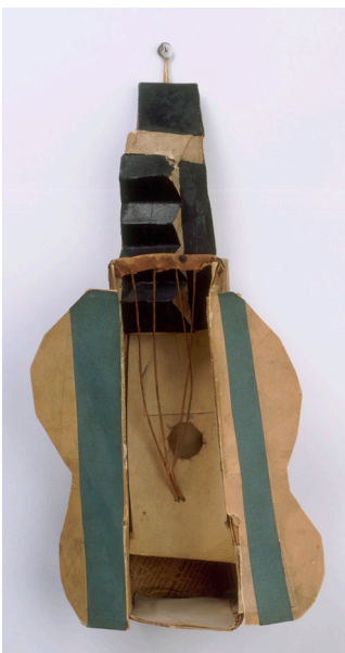
FIG. 2 PABLO PICASSO