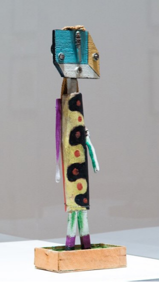
FIG. 4 PABLO PICASSO Figure, spring 1938 Painted wood, nails, and screws with string wire, paintbrush fragments, and push-bell hardware on an unfired clay and wood base, 5,8 x 2 x 1,1 cm Private collection © Succession Picasso, 2016